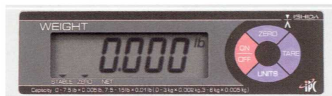
Large Display Panel

Answering the call for simplicity, portability and reliability...the iPC delivers exceptional all-around performance.