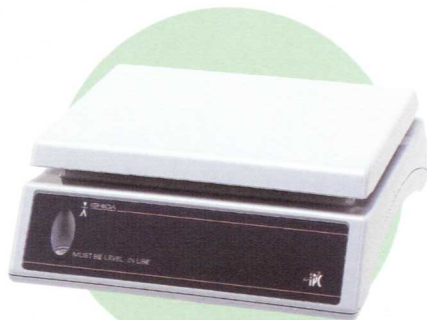
Dual Display Model