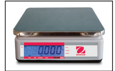
Rear display shown (dual-display models only)