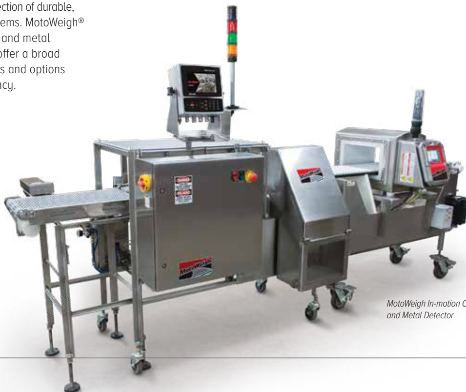
MotoWeigh In-motion Checkweigher and Metal Detector

Keep production moving with Rice Lake's wide selection of durable, in-motion scale systems. MotoWeigh® in-motion weighing and metal detection systems offer a broad selection of features and options to maximize efficiency.