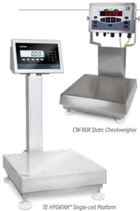
CW-90X Static Checkweigher