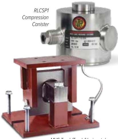
MVS Truck/Track/Horizontal Tank Module