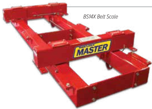
BS14X Belt Scale