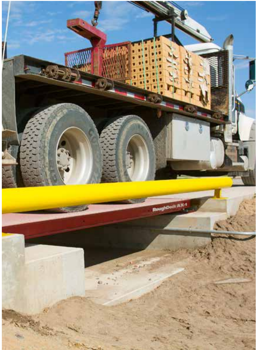
RoughDeck AX-1 Axle Scale

OnTrak® effectively manages truck scale data including customer, hauler, transaction, product and more. Use OnTrak Enterprise to enable web server capabilities and access truck scale data on PCs or handheld devices from anywhere.