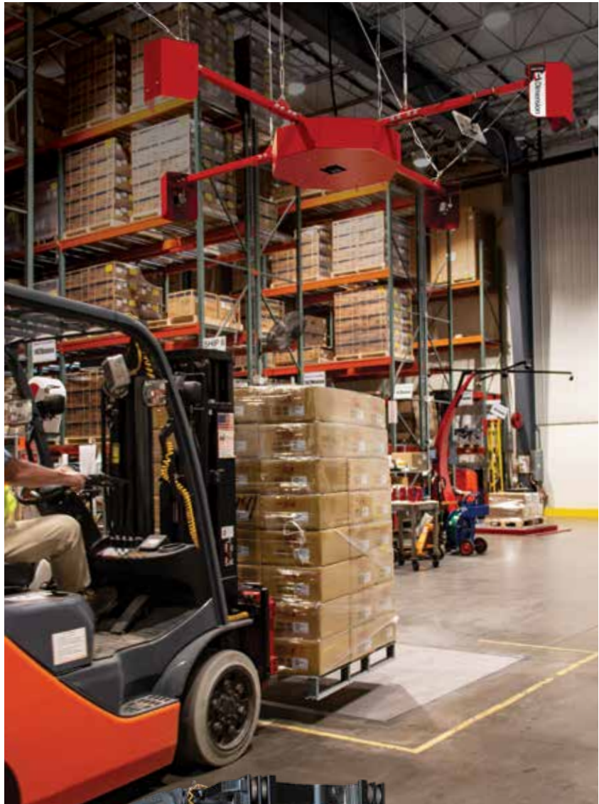
iDimension LTL Series

Rice Lake's iDimension Series captures images of packages, flats, poly bags, tubes and irregular shaped items in record time to calculate the dimensions of your packages for shipment. iDimension pallet dimensioners with Stop & Go streamline pallet processing by capturing measurements without forklift operators dropping the pallet or removing forklift tines. The iDimension Series provides carriers with the dimensions and weight of pallets and packages in less than a second.