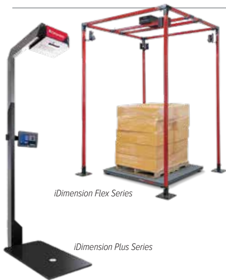
iDimension Flex Series