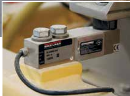
RL30000 Load Cell