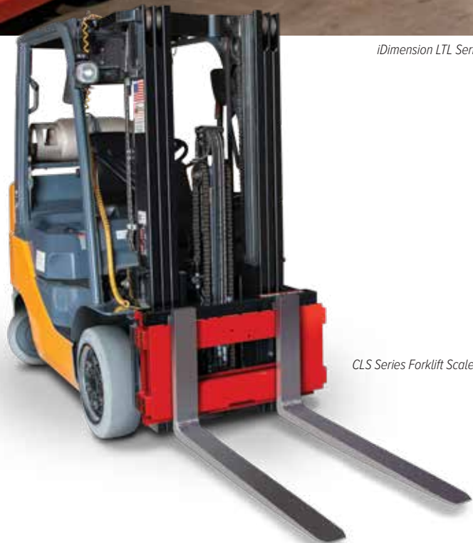
CLS Series Forklift Scale