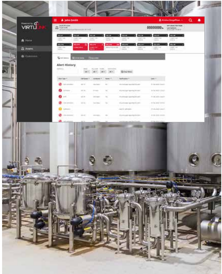
VIRTUlink IoT Gateway