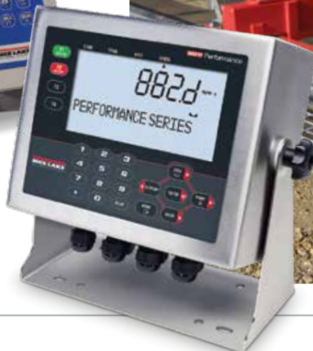
882D Belt Scale Integrator