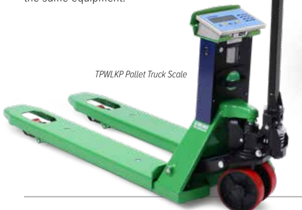
TPWLKP Pallet Truck Scale

Eliminate the need for extra steps in your material handling process. Instead of bringing product to the scale, bring the scale directly to the product. Rice Lake's forklift and pallet truck scales increase efficiency for material handling operations by allowing you to weigh and transport product with the same equipment.