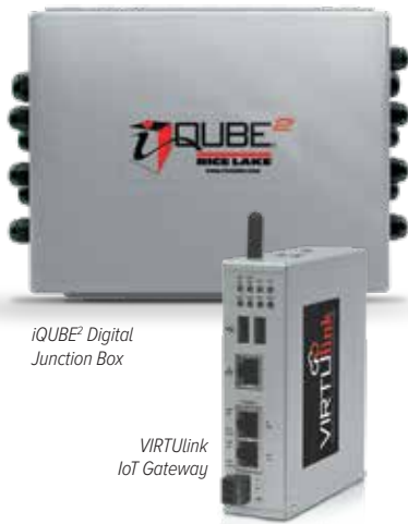
iQUBE Digital Junction Box