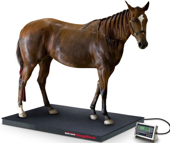
Roughdeck® EQ with 482 Indicator

Rice Lake Weighing Systems' RoughDeck® EQ equine scales are designed specifically for the safe and reliable weighing of horses of all breeds and sizes. The heavy-duty removable mat provides extra cushion comfort and is noise-reducing, creating a calm weighing environment.