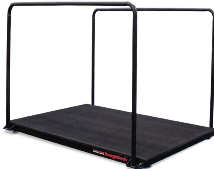
Roughdeck® EQ with Guide Rails