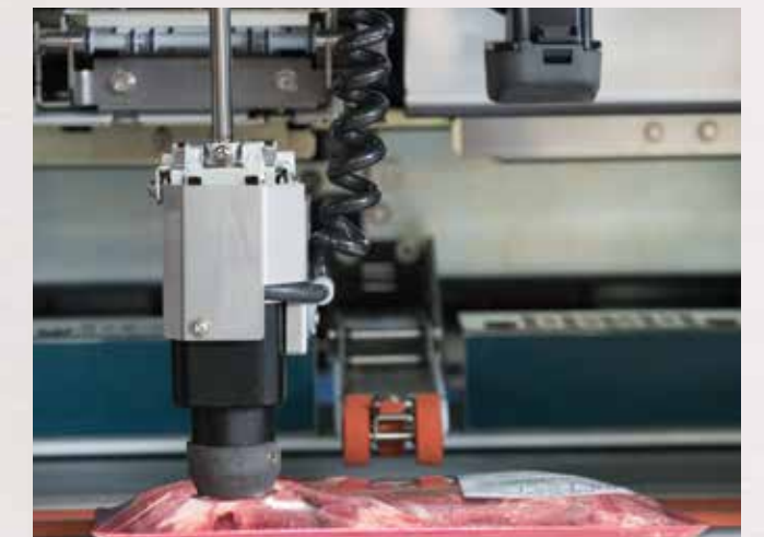
Day Glow Label Applicator

The unique robotic dual-applicators can apply labels on the tray in various locations, and in either direction (standard or rotated). Additionally, the applicators are designed to provide delicate and reliable labeling using built-in sensors that detect contact pressure with the tray. Labels are consistently applied accurately and straight on all products without damaging packaging or contents.