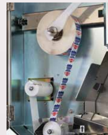
Day Glow Label Loading Area

Front-loading both label and film rolls reduces additional space requirements on the sides of the wrapper. Simply hang a film corner on the supplied hook when loading and the film will automatically set in the wrapper. Stainless steel covers keep the film warm and clean to ensure the best wrap possible. A sliding chassis accommodates the label roll holder, which easily extends for loading label rolls.