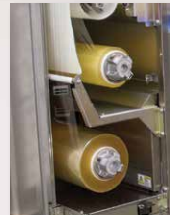
Film Loading Area with Auto Set

Two film sizes are loaded on only one side of the wrapper—reducing space while increasing efficiency. The appropriate film size is automatically selected for wrapping, and the pre-stretch function provides a smooth finish with a tight wrap.