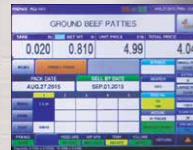
Large, 12.1-inch LCD Color Touchscreen

The WM-Ai Day Glow Labeler is a flexible wrapping system designed to meet each customer's individual requirements. Toggling between standard operation and optional functions is made simple with the 12.1-inch LCD color touchscreen. Operational ease is further enhanced with many automated functions designed into the system—from film selection to tray centering to robotic label application and more.