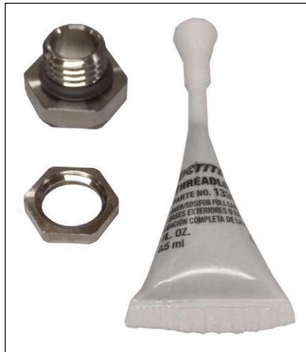
Figure 1. Part Kit Components (PN 222569)