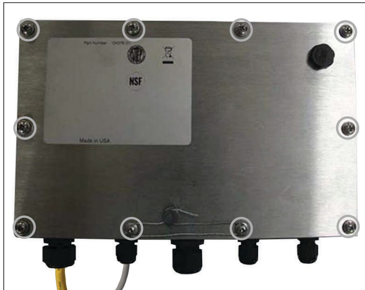
Figure 2. Backplate Nut Locations