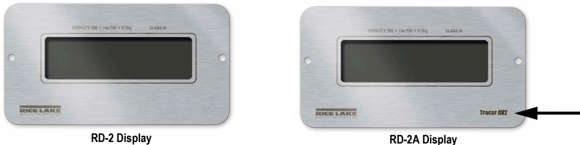
Figure 1. Display Faceplate with Tracer AV2 Etching on the RD-2A Display